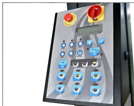
PCB: CLICK ACCESS BUTTONS