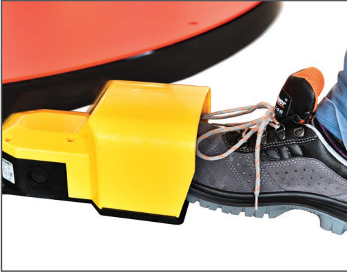
PIZZATO -INDUSTRIAL FOOTSWITCH FOR CYCLE'S MANAGEMENT.