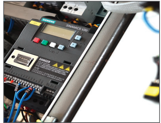
SIEMENS V20 INVERTER

SIEMENS V20 Inverter; Loading plate: 1500 mm; Maximum loading weight: 1200 kg; External potentiometer for turntable speed adjustment; Industrial footswitch; Stop at 0 position; Powder coating; Braked turntable at the end of the cycle; 2 years warranty.