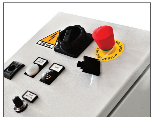
EXTERNAL POTENTIOMETER FOR TURNTABLE'S SPEED ADJUSTMENT